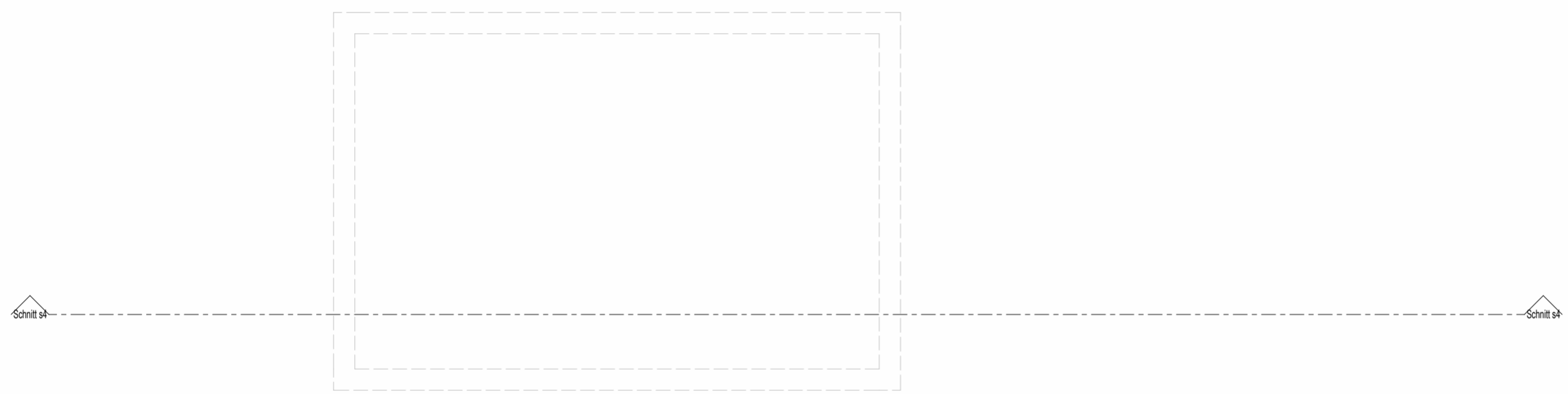
1. Obergeschoss M 1:100